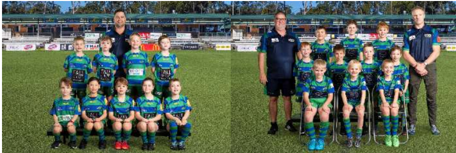
Under 7 White