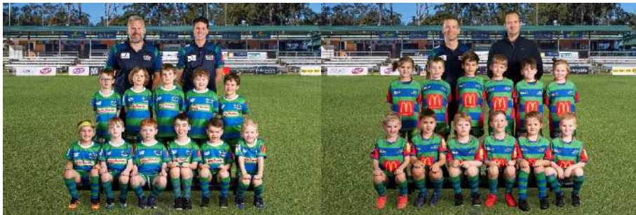
Under 6 Grey