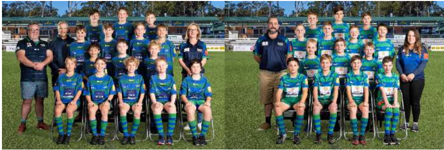
Under 10 Blue