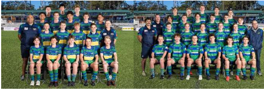
Under 14 White