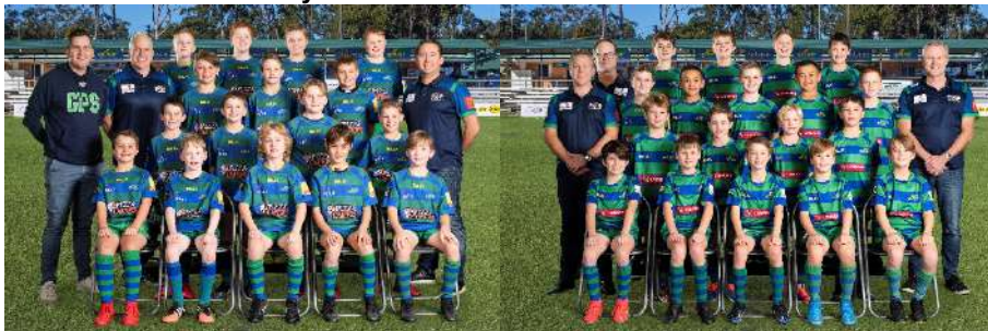
Under 10 Navy