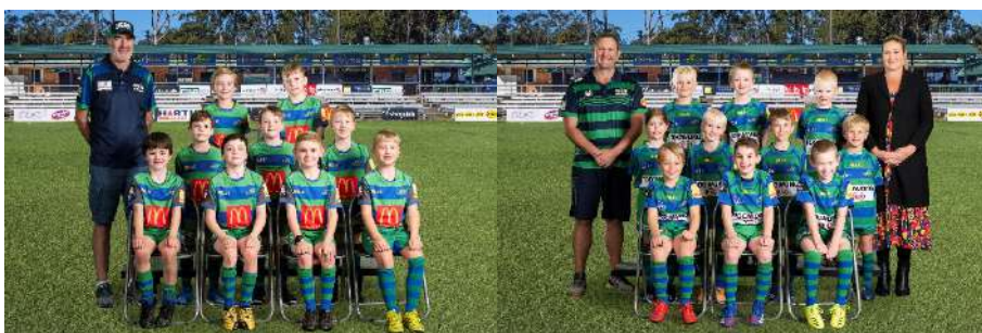
Under 8 Silver