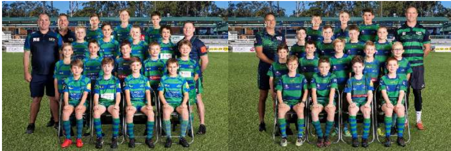
Under 10 Grey