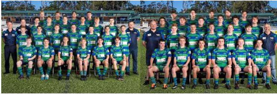
Under 15 Gold Under 16 Blue