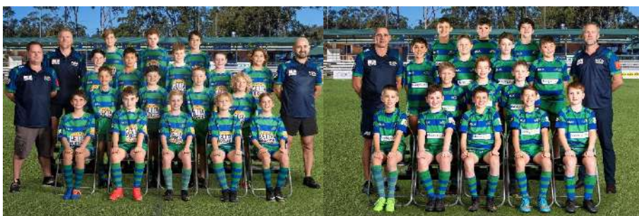
U 11 Orange