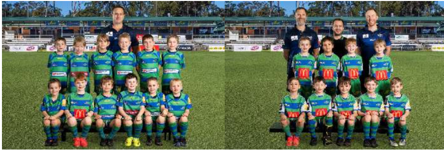
Under 7 Maroon