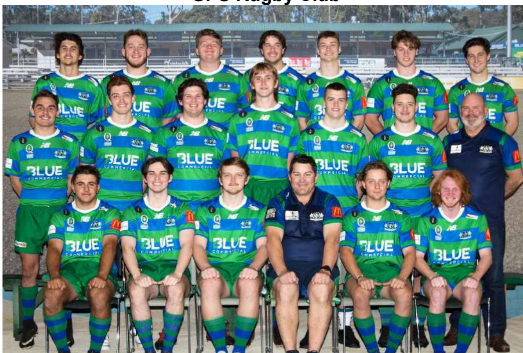
GPS Rugby Colts 3