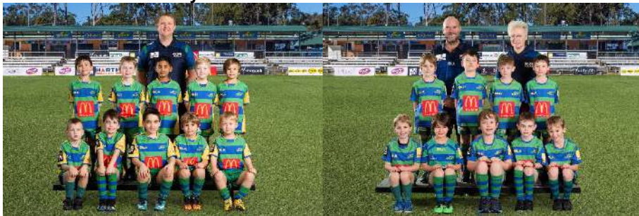
Under 6 Orange