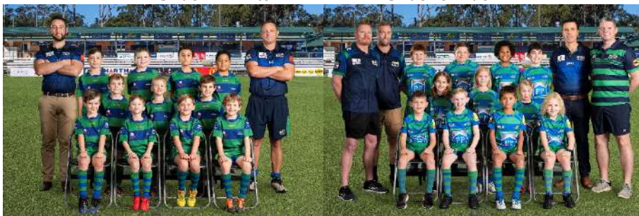
Under 8 Gold