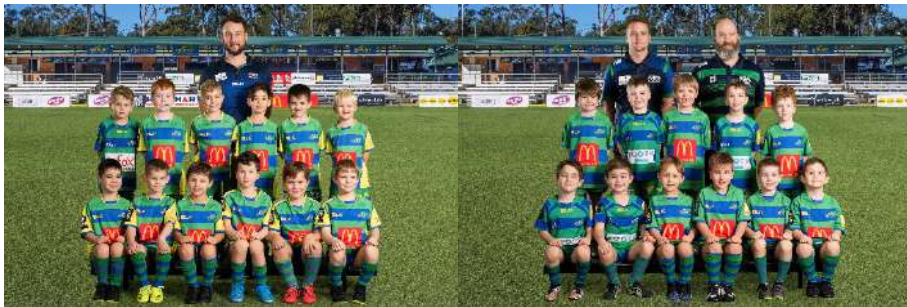
Under 6 Gold