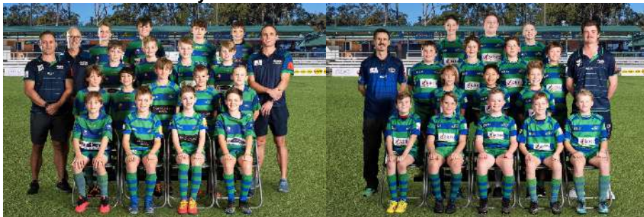
Under 10 White