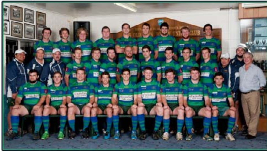
SECOND GRADE - BRISBANE SECOND GRADE - MINOR PREMIERS - PREMIERS - 2012