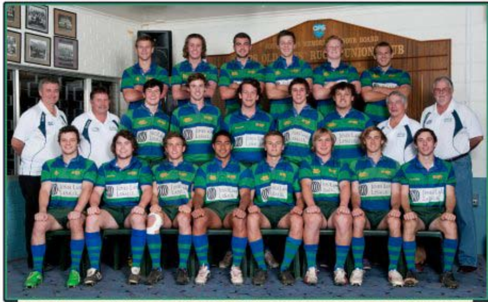
COLTS 1 - BRISBANE COLTS DIVISION 1 - PRELIMINARY FINALISTS - 2012