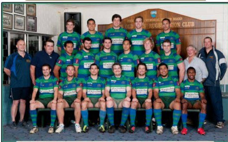
FOURTH GRADE - BRISBANE FOURTH GRADE - PREMIERS - 2012