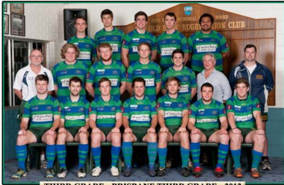
THIRD GRADE - BRISBANE THIRD GRADE - 2012